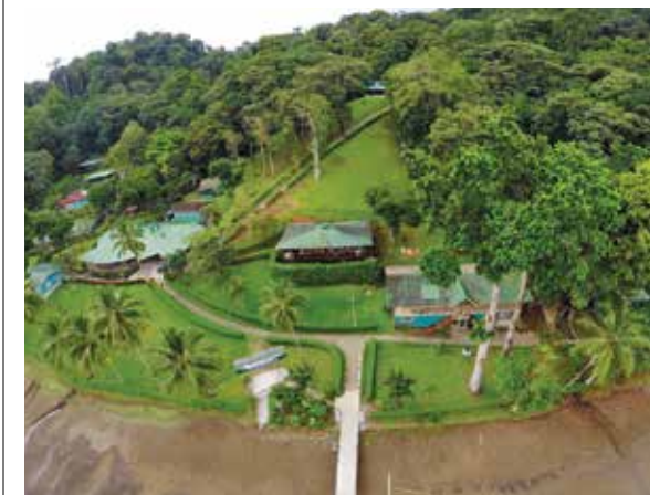
FAR LEFT: Tranquilo Bay Lodge sits tucked into Panama's Caribbean jungle. LEFT: An aerial view of famed Tropic Star Lodge.

COMMENTS: Tropic Star prides itself on being a world-class resort, widely renowned and multiple-award-winning. It offers a long list of amenities (see its website). Many big names have shown up on its guest list (e.g., John Wayne, Fuzzy Zoeller, Guy Harvey).