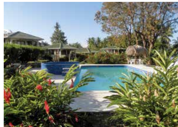
ABOVE: One of the most common of large groupers off Panama, the broomtail readily strikes metal jigs. LEFT: Hooked on Panama's lodge is located on the remote western fringes of Pacific Panama.

TACKLE: Shimano conventionals with 30- to 80-pound mono for trolling, live-baiting; Shimano