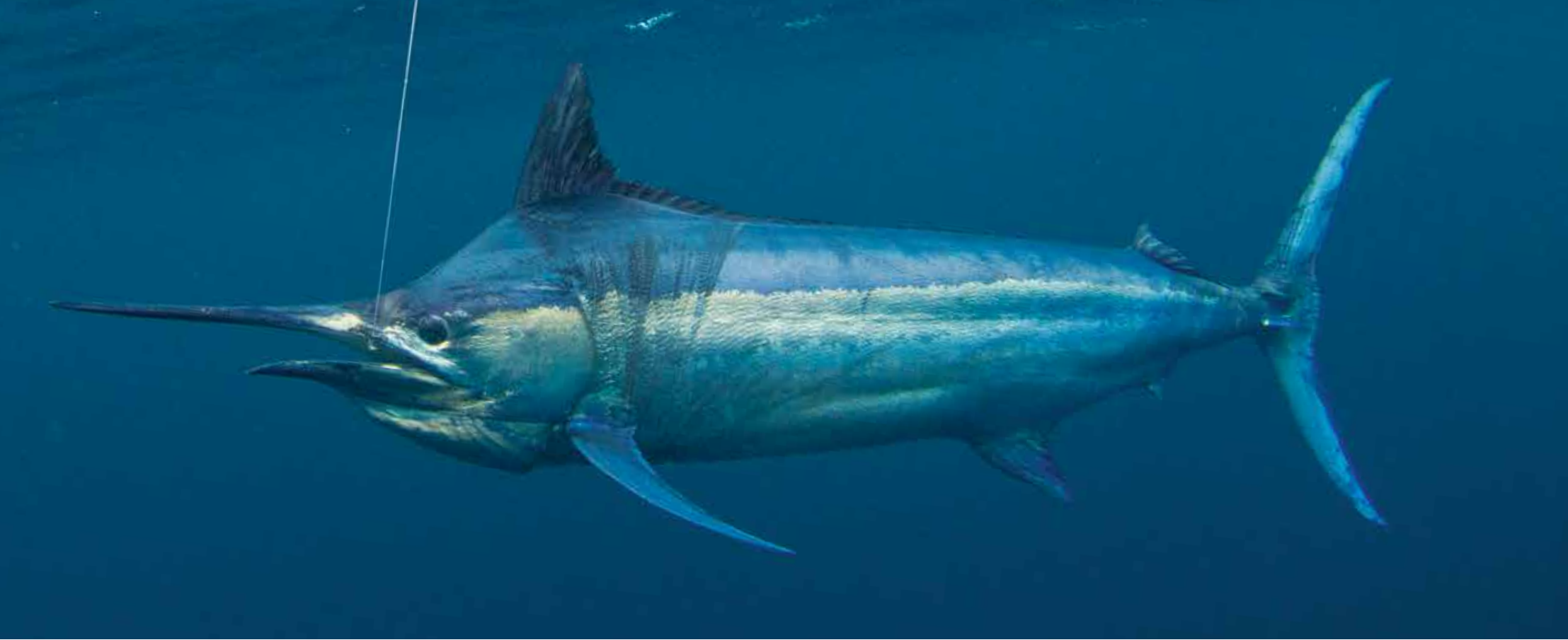
ABOVE: While giant black marlin patrol the country's Pacific coast, Piñas Bay offers the best shot. BELOW: Room with a view of the Gulf of Chiriquí from Propiedad de Paradise Lodge on Isla Parida.