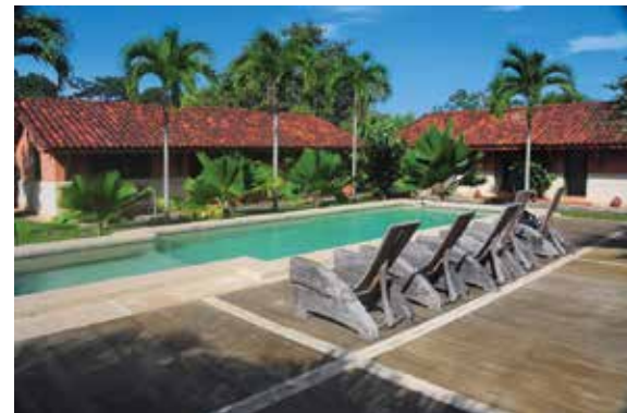
Panafishing Adventures' lodge is located near Pedasi. It's a five-minute drive to the sandy beach on the southwestern fringes of the Gulf of Panama.

Shimano Stella and Saragosa reels with Smith or Black Hole rods for popping and jigging. Reels are spooled with 50-, 65- and 80-pound Jerry Brown braid.